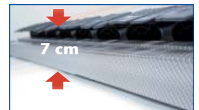
Extra-flat frame, developed for particularly low designer beds.

Exclusive sleeping comfort is the result of very exact coordination between the mattress and the slatted frame. Many Classic Plus 42 functional details ensure that the mattress is very responsively supported over the entire surface: Flexible shoulder comfortzone, continuously adjustable middle section with dual slat system and central strap for even weight distribution, flexible, noiseless suspension with movable trio-caps, surface structure end caps prevent mattress from sliding, the slat spring functionality out to the edges, extra-flat frame. Exclusive mattress base technology for excellent SCHLARAFFIA mattresses.