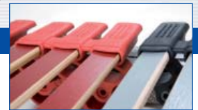
Textured caps bind 3 slats together.